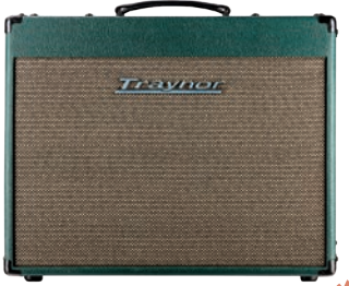
Traynor 20th Anniversary 40w All-Tube Combo With 12" Celestion G12M-65 Creamback speaker. YCV4050 | 726452 $999