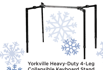
Collapsible Keyboard Stand IKS-8 ı 219464

long-mcquade.com/lessons or details on how to get started.