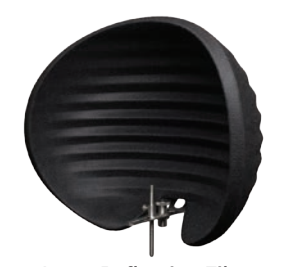
Aston Reflection Filter In black or purple. AST-SHADOW/AST-HALO | 496977/483155 Reg: $369 Special $299