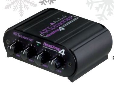
ART 4-Channel Headphone Amp HEADAMP4 | 260296 Reg: $89.99 Special $69.99