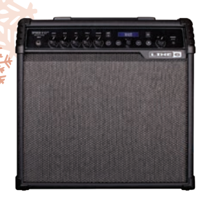
Line 6 Spider V MKII Series 60w 1x10" Combo Amp SPIDER5MK2-60 i 714628 Reg: $439 Special $399.99