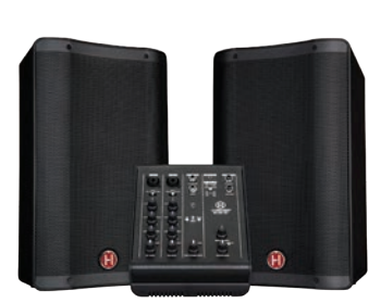
Harbinger Pro Audio 6-Ch/200w Portable PA System with Bluetooth & FX M200-BT i 717937