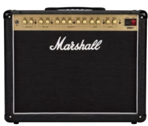
Marshall 40w Combo Amp DSL40CR | 517175 $1049.99