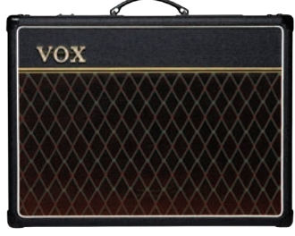
Vox 15w 1x12" Tube Combo AC15C1 i 317747 $949.99