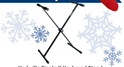
Yorkville Single X Keyboard Stand IKS-X1 i 139840