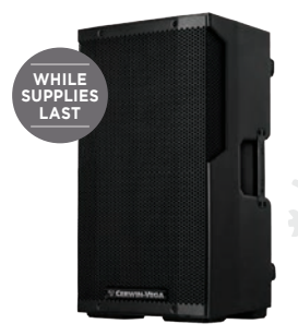
Cerwin Vega Powered Speakers with Bluetooth

CVE-10 i 10"/1000w i 497057 Reg: $459 Special $399 CVE-12 i 12"/1000w i 497061 Reg: $549 Special $499 CVE-15 i 15"/1000w i 497062 Reg: $659 Special $599