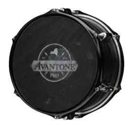
Avantone Pro Sub-Frequency Kick Drum Mic AV-KICK 1733020 $479