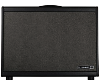
Line 6 Powercab 112 1x12" Active Speaker System POWERCAB112 | 688836 $819