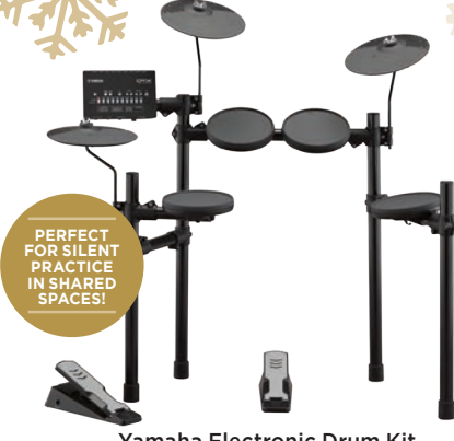
Yamaha Electronic Drum Kit DTX402K | 694997 $599.99