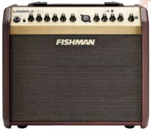
Fishman Loudbox Mini 60w Amp with Bluetooth

Includes slipcover and digital chromatic tuner. PRO-LBT-500 I 706972 $499