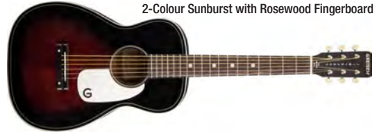
2-Colour Sunburst with Rosewood Fingerboard