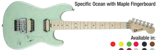
Specific Ocean with Maple Fingerboard