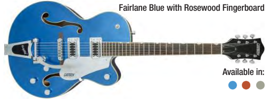
Fairlane Blue with Rosewood Fingerboard